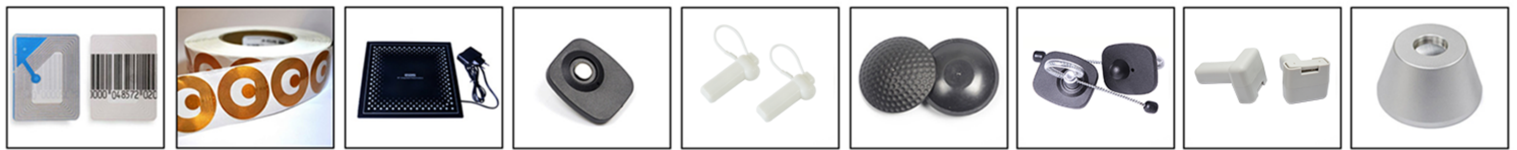
Soft label Soft label Deactivator Hard tag Lanyard tag Hard tag Wine tag Optical tag Detacher